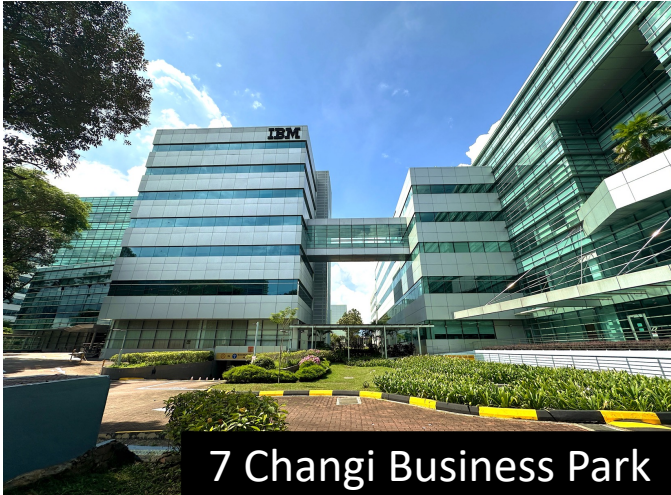
7 Changi Business Park