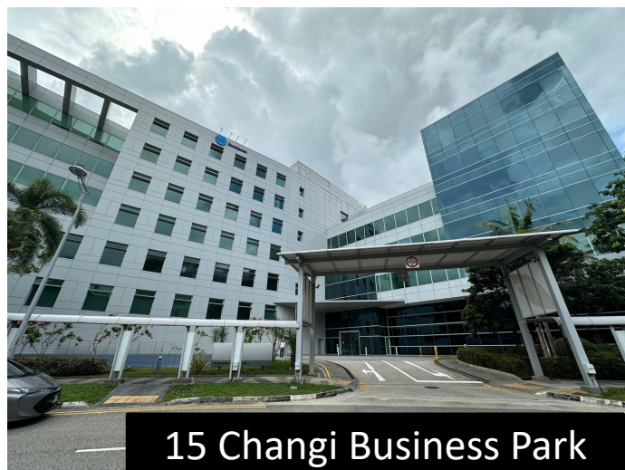
15 Changi Business Park